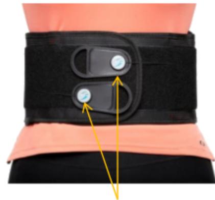
Dual Independent Mechanical Advantage Pulley System