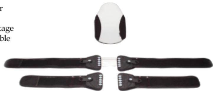
Contoured Padded Posterior Panel provides unsurpassed comfort and support

* Note: Medical advice should be sought on the appropriateness and the condition under which any given spinal bracing system should be utilized.