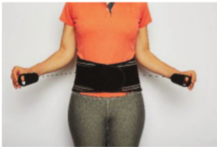
Pull dual pulley handles out and away to desired compression and support.