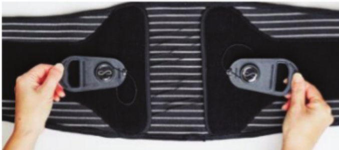
Initially align pulley handle to the side of the brace prior to each fitting.

For a consistent fit, make sure you follow these easy steps each time you apply the brace.