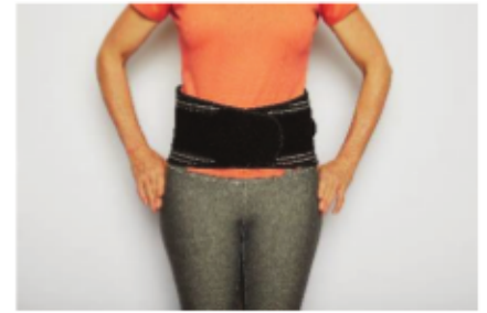
Then wrap right side on top of the left panel to close and attach in front.