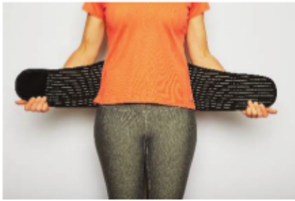
Center back panel on the spine.