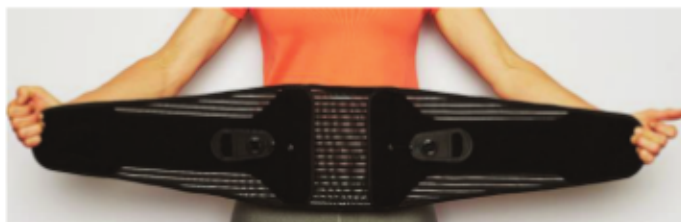
Extend or pull the brace completely out prior to each application.

To Shorten the Length of the Nylon Cord on the Pulley Handle: