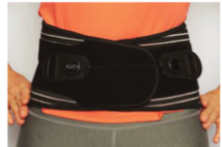
Adjust tension for sitting or standing.

For a consistent fit, make sure you follow these easy steps each time you apply the brace.