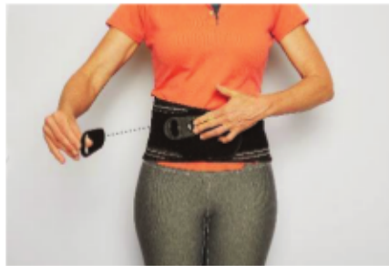
Place each handle on the fabric for a secure fit.