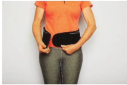
Wrap the left side to the front, positioning the front panel.