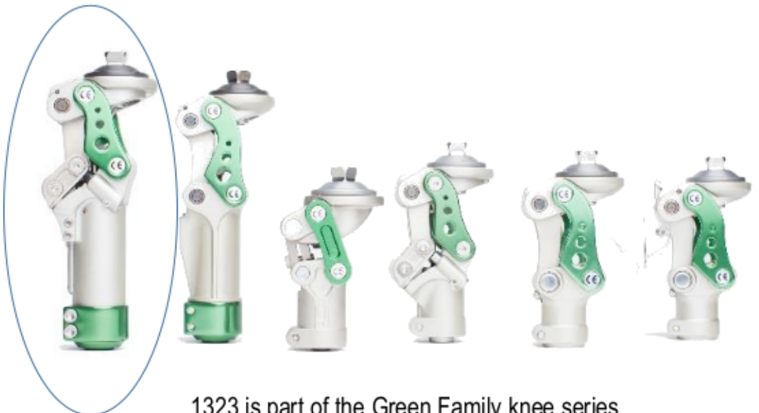
1323 is part of the Green Family knee series